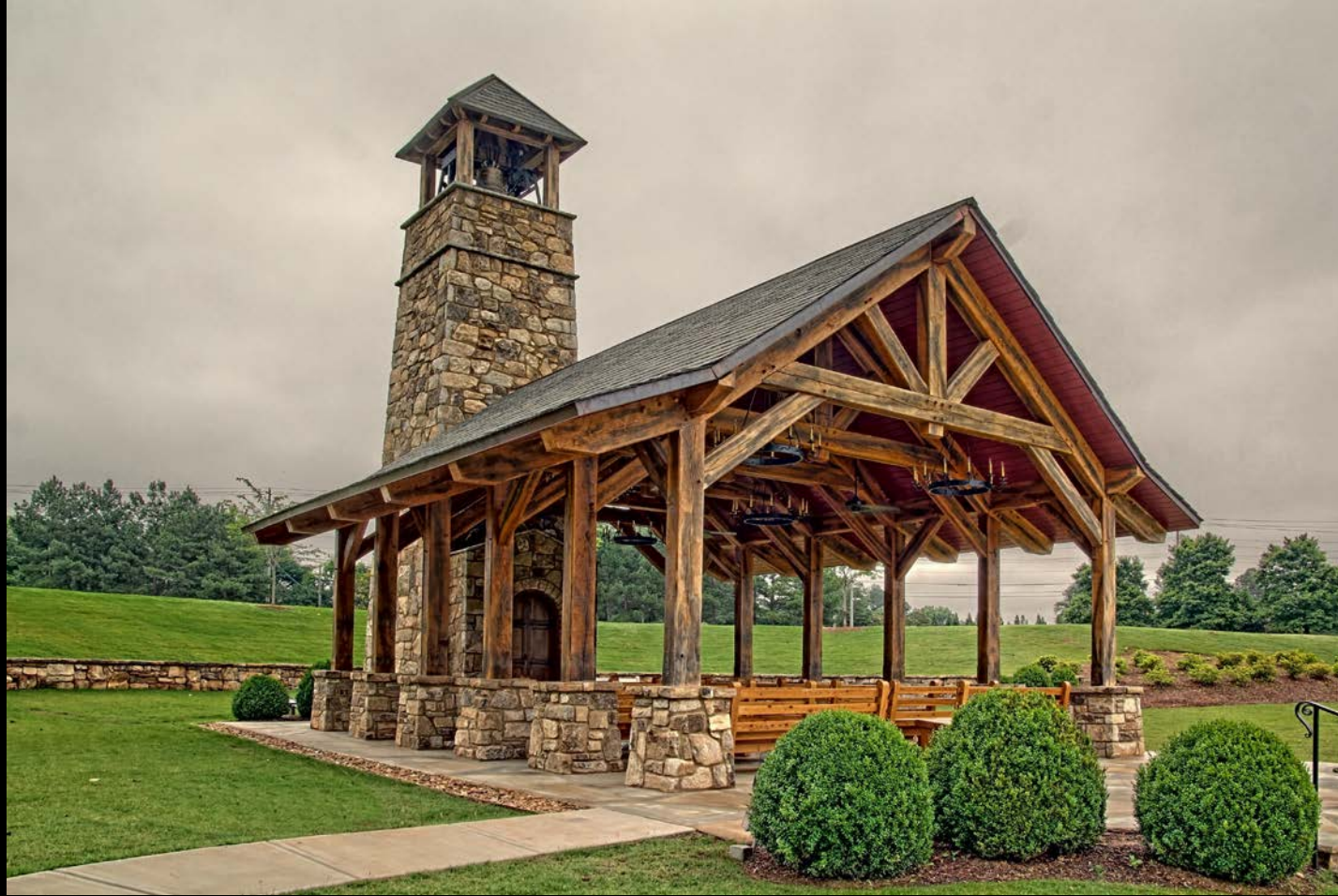
Portfolio of Selected Work